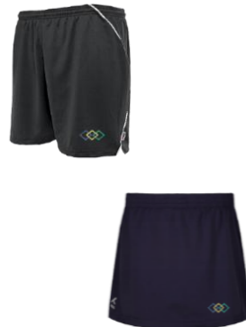
PE Short From £13.35 or PE Skort From £17.50