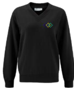
V-Neck Sweatshirt From £14.95