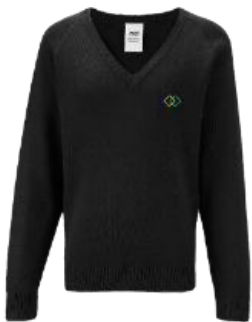
V-Neck Knitted Jumper From £20.55