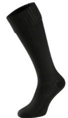
Sports Socks From £6.50