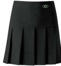
Skirts From £16.00