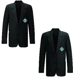
Blazer – Boys or Girls From £36.95