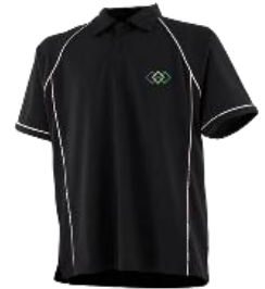
Unisex PE Polo From £16.45