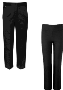
Senior Boys & Girls Trousers From £15.40

ONLINE ORDERING AT https://orchardschoolwear.co.uk/shop/parent/school/117/products OR SCAN THE QR CODE AT THE TOP LEFT OF THIS PAGE COLLECTION IN STORE IS AVAILABLE FREE OF CHARGE