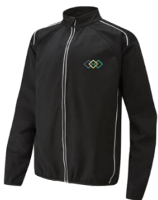
PE Full Zip Jacket From £27.30